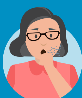
PERSISTENT COUGH & WHEEZING