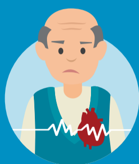
IRREGULAR HEART BEAT