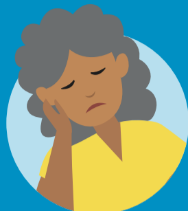
FATIGUE & WEAKNESS