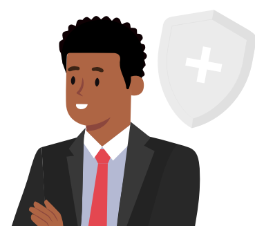
Health Insurance Representatives

PATIENTS & HEALTH CARE PROVIDERS ARE OFTEN LEFT OUT.