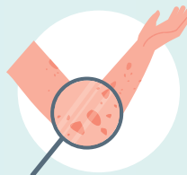
Eczema & Psoriasis