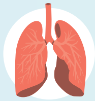
Asthma & COPD

Biologics can treat a wide range of conditions, including: